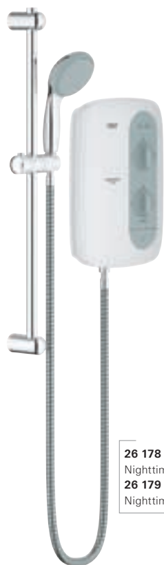
26 178 000 Nighttime Grey, 8.5kW 26 179 000 Nighttime Grey, 9.5kW