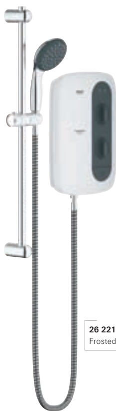
26 221 000 Frosted Granite, 9.5kW