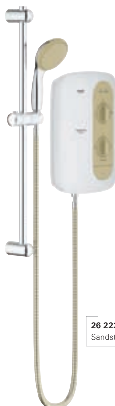
26 222 000 Sandstone, 9.5kW